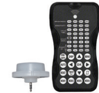
Motion Sensor (MS) & Remote Control