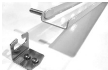
Figure 4 - DOOR RETAINER BRACKET DETAIL