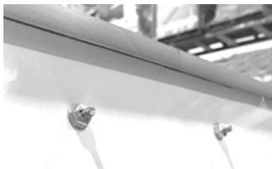
Figure 3 - DOOR HANDLE ASSEMBLY